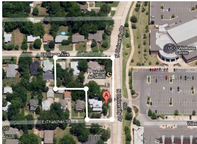
Proposed location for 10,000 s.f. HQ for Terrorist Affiliate Organizations